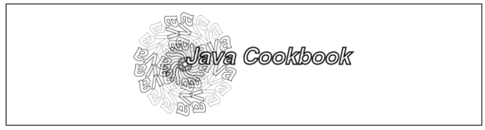
Figure 11-2. PostScript printer output

Just as the SerialPortOpen program set the port's parameters, the ParallelPortOpen program sets the parallel port access type or "mode." Like baud rate and parity, this requires some knowledge of the particular desktop computer's hardware. There are several common modes, or types of printer interface and interaction. The oldest is "simple parallel port," which the API calls MODE_ SPP. This is an output-only parallel port. Other common modes include EPP (extended parallel port, MODE_ECP) and ECP (extended communciation port, MODE ECP). The API defines a few rare ones, as well as MODE ANY, the default, and allows the API to pick the best mode. In my experience, the API doesn't always do a very good job of picking, either with MODE_ANY or with explicit settings. And indeed, there may be interactions with the BIOS (at least on a PC) and on device drivers (MS-Windows, Unix). What follows is a simple example that opens a parallel port (though it works on a serial port also), opens a file, and sends it; in other words, a very trivial printer driver. Now this is obviously not the way to drive printers. Most operating systems provide support for various types of printers (the MacOS and MS-Windows both do, at least; Unix tends to assume a PostScript or HP printer). This example, just to make life simple by allowing us to work with ASCII files, copies a short file of PostScript. The intent of the PostScript job is just to print the little logo in Figure 11-2.